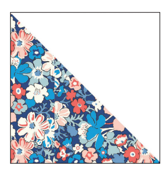
HALF SQUARE TRIANGLE

(8 Half Square Triangles will not be used.)