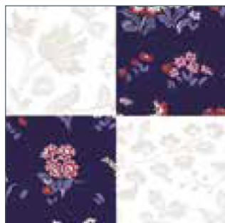
16 Four-Patch Blocks