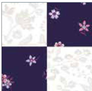
16 Four-Patch Blocks

Sew the segments together to make 32 Four-Patch Blocks.