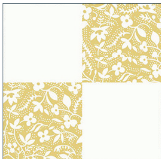
FOUR PATCH BLOCK

Sew a 2½" white strip to a 2½" Niki Wildflower C strip. Cut the strip into 2½" segments. Repeat with the remaining 2½" white strips and 2½" Trailing Marigold C and Yolande Blossom C strips. Sew the segments together to create 32 Four-Patch Blocks (8 Niki Wildflower C, 8 Trailing Marigold, and 16 Yolande Blossom C).