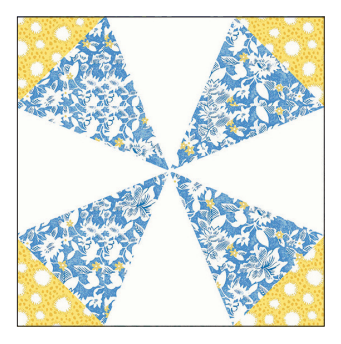
YELLOW CORNER ON FABRIC TRIANGLE