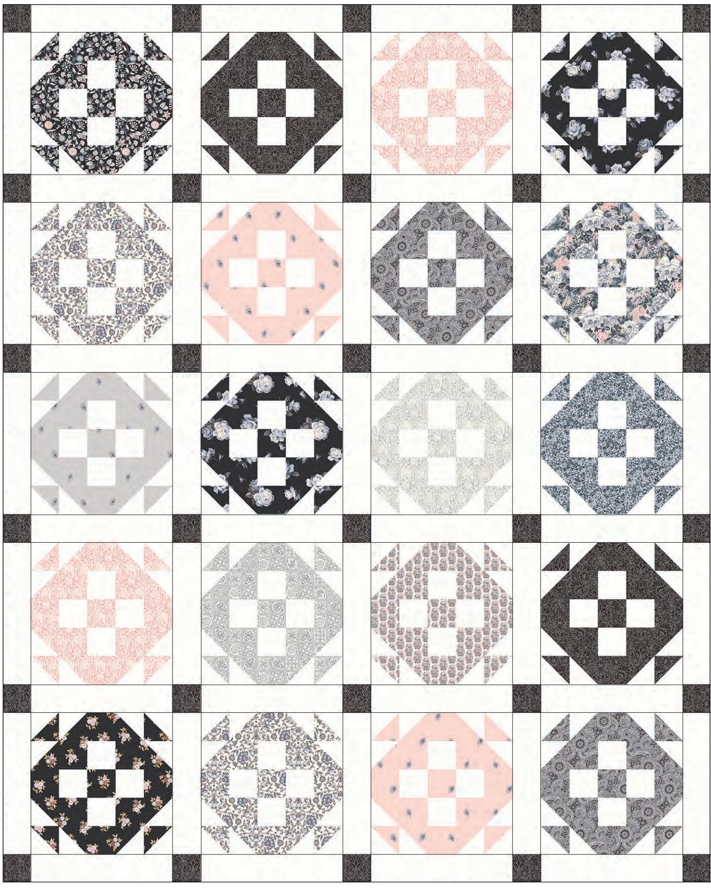
QUILT CENTRE DIAGRAM